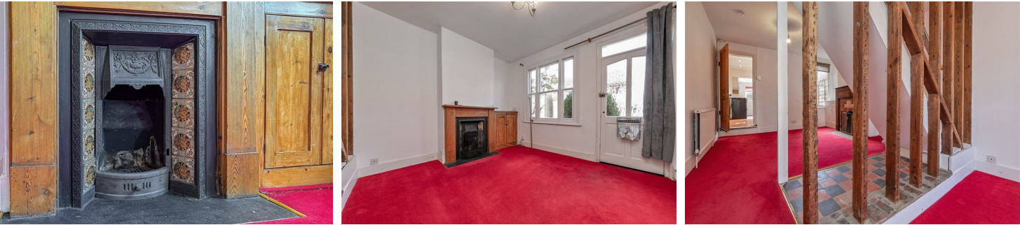
Ground Floor Approx. 396.6 sq. feet

Nestled in the heart of St. Albans on Cannon Street, this charming terraced cottage presents a wonderful opportunity for those seeking a home with character and potential. With two spacious reception rooms, this property offers ample space for both relaxation and entertaining. The two double bedrooms provide comfortable accommodation, making it ideal for couples, small families, or even as a rental investment. The cottage features a well-appointed bathroom, ensuring convenience for daily living. While the property requires some modernisation, this presents a unique chance for the new owner to personalise the space to their taste and style. The private rear garden is a delightful addition, offering a tranquil outdoor retreat for gardening enthusiasts or a perfect spot for al fresco dining during the warmer months. Being chain-free, this property allows for a smooth and efficient purchase process. Its prime location close to the city centre means that residents can enjoy easy access to a variety of shops, restaurants, and local amenities, as well as excellent transport links for commuting. In summary, this terraced cottage on Cannon Street is a fantastic opportunity for those looking to create their dream home in a vibrant and sought-after area of St. Albans. With its blend of charm, potential, and convenience, it is not to be missed.